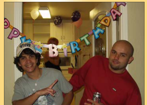
Happy, happy birthday!

More Information & Photos at www.sunrisehomesinternational.com