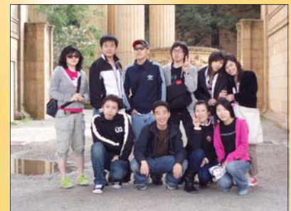
Our student "family" on a sight-seeing trip. Here is so much to see and to do, it's never boring!

"All our students, our Student Assistants, our Student Home Manager, the staff at school, and I are inviting you to join our happy student family. We promise that you will have the most wonderful experience in the USA!"