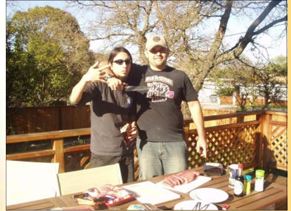
Our large patio and the California sunshine invite to a BBQ. All students are welcome!