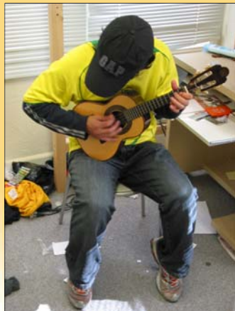
So many possibilities to have fun at the Student Home!