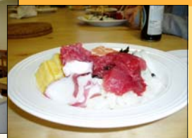
The most delicious food is prepared in our fully equipped kitchen!

More Information & Photos at www.sunrisehomesinternational.com