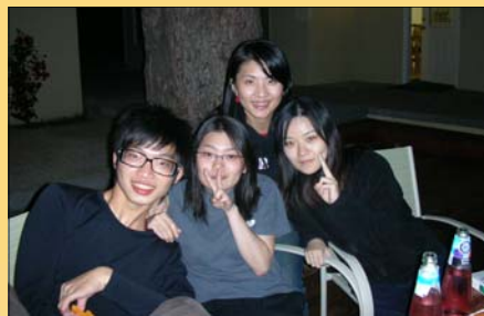
One of our popular dinner parties in the yard of the Student Home.