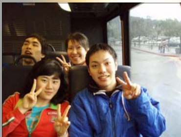
Our free shuttle bus takes students to school, downtown and the mall!