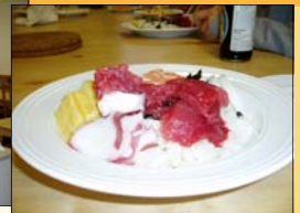
The most delicious food is prepared in our fully equipped kitchen!

More Information & Photos at www.sunrisehomesinternational.com