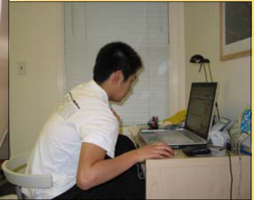
Some students prefer to study in their rooms, others like to study together with their friends in the living room or the dining room.