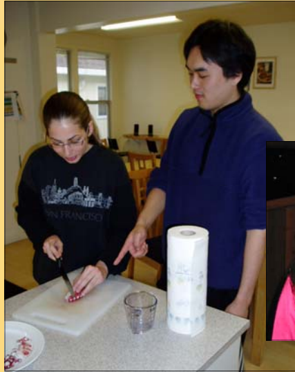
Japanese students teach Brazilian students how to make sushi.