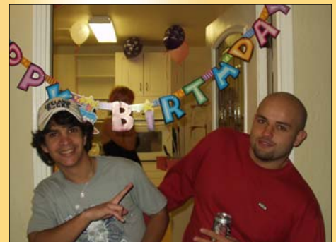
Happy, happy birthday!

More Information & Photos at www.sunrisehomesinternational.com