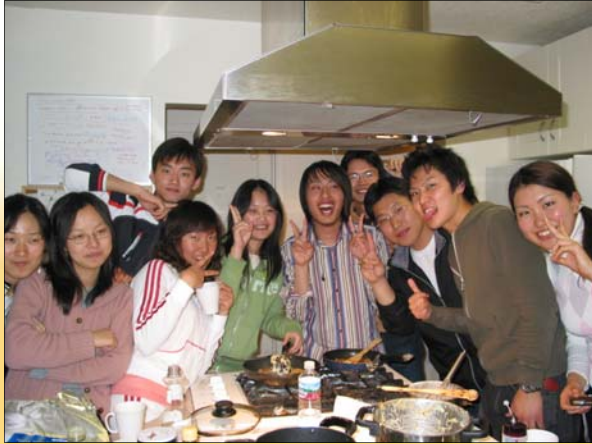
Our students enjoy cooking their countries' specialties for their friends at the Student Home.

179 Los Ranchitos Road, San Rafael, CA 94903