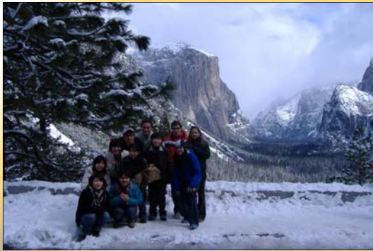
Yosemite National Park is one of the favorite weekend destinations of our students.