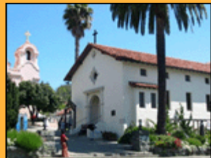
The historic mission of San Rafael is only one of many sight-seeing opportunities.