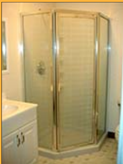
Our daily cleaning service keeps all bathrooms clean.