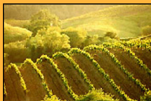
The famous Napa Valley wine region is only 30 minutes away.