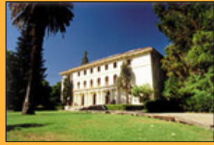
The beautiful campus of Dominican University.

179 Los Ranchitos Road, San Rafael, CA 94903