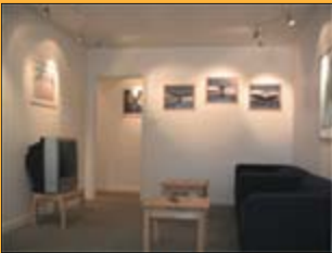
In the Living Room, students enjoy watching movies from our large DVD collection.