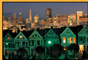
San Francisco can easily be reached by express bus.