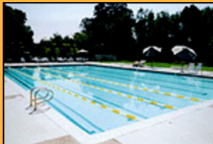
Dominican's new and modern recreation center.