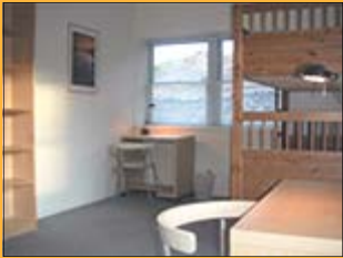
Large bedrooms with pictures and modern furniture

"Here at the Student Home I am very happy! It is a very friendly and relaxing place. It is very clean, the furniture is new, and I have very fast Internet at my desk. Everybody here is an international student, and it is very easy to make friends from all over the world. We often have dinner together: somebody cooks and then invites all other students. I can try many different kinds of food. In addition, I can save much money." - Zoe Hsiao-Ju Chen (Taiwan)